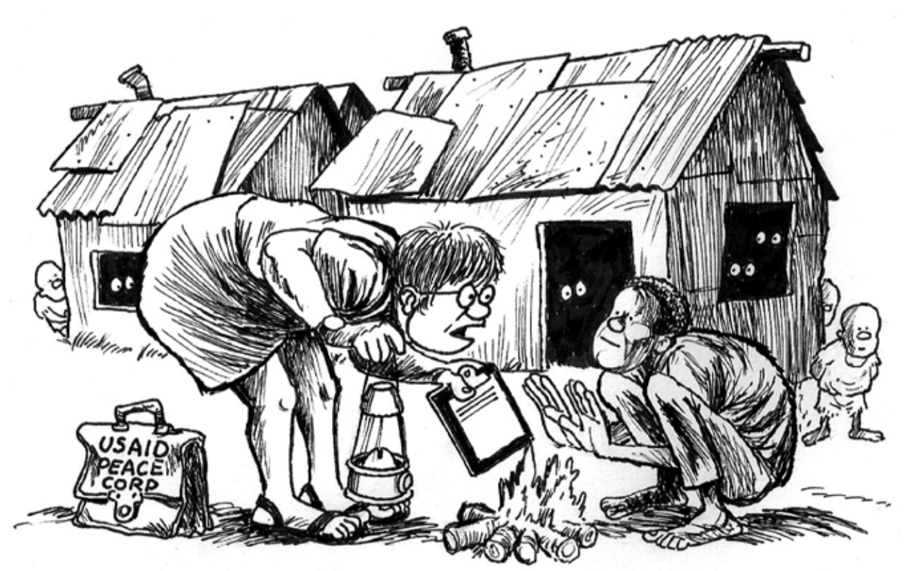
"Will you sign our petition for cleaner power?"