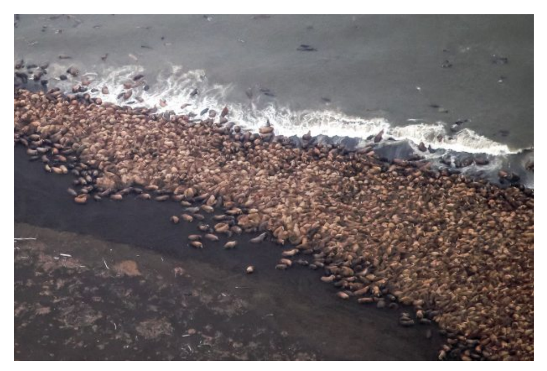
Figure 2: Walruses at Point Lay, Alaska on 27 September 2014

These animals were not stranded, as some stories stated; they swam there willingly, perhaps from the ice edge, and were feeding there.<sup>8,9</sup>