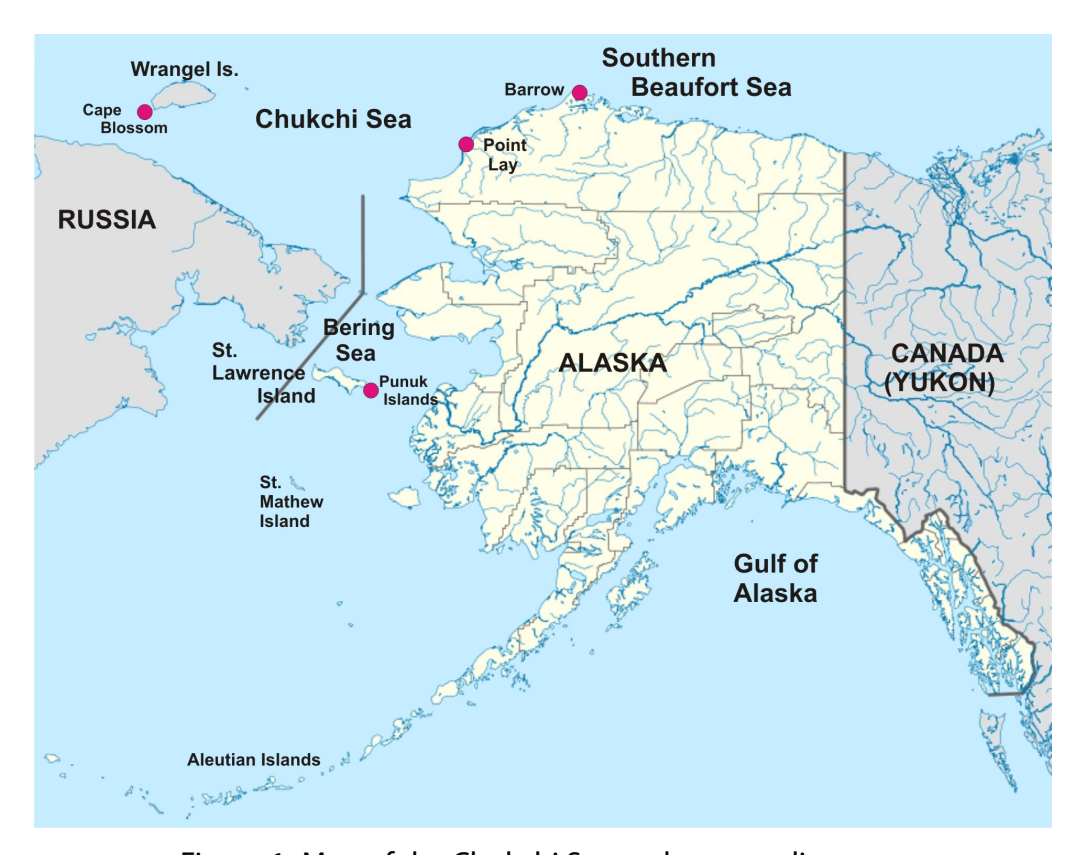
Figure 1: Map of the Chukchi Sea and surrounding area

On 12 September 2014, biologists for the National Oceanic and Atmospheric Administration (NOAA) performing a routine aerial survey of marine mammals in the Chukchi Sea noted close to 10,000 Pacific walruses<sup>1</sup> hauled out at Point Lay, Alaska (see Fig. 1). The walruses, primarily females and calves, were moving on and off shore, feeding.<sup>2</sup> By 23 September, the number of walruses hauled out on the beach had declined to about 1500 but on the 27th, the herd had swelled to about 35,000 animals (Fig. 2). At least 36 animals had apparently been trampled to death, a not unexpected finding since any disturbance (e.g., airplane overhead, approaching polar bear) can cause a stampede of animals towards the safety of the water, and in such large herds, weak or young animals simply get crushed in the chaos.<sup>2</sup> The NOAA biologists took some aerial photos and a few days later, the phenomenon was international news.