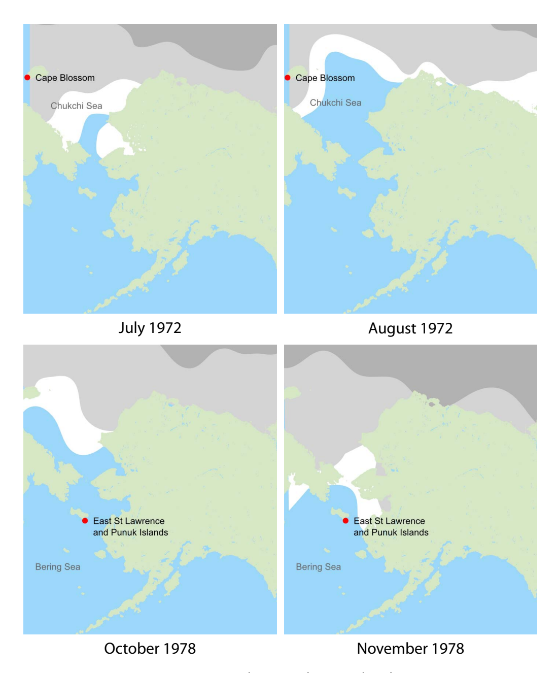
Figure 4: Haulouts and sea ice levels

Monthly averages for: (top) prevailing conditions before and during the haulout at Cape Blossom, Wrangel Island, 1972; and (bottom) prevailing conditions before and during the massive haulouts on eastern St. Lawrence Island and the nearby Punuk Islands, 1978. Sea ice concentrations: white, 0–30%, light grey, 30–90%, dark grey, 100%. Redrawn from the Historical Sea Ice Atlas, University of Alaska, Fairbanks.<sup>25</sup>